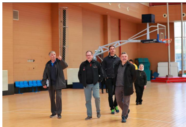
Visit and inspect Disabled Sports Training and Guidance Center of Zhejiang province