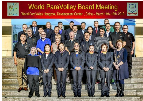
WPV Members Group Photo with Base Staffs Serving the Meeting