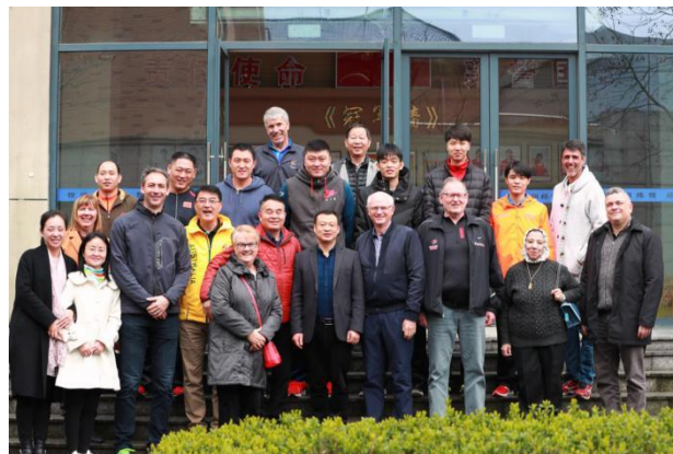
Photos with Paralympic Champions at Disabled Sports Training and Guidance Center of Zhejiang province