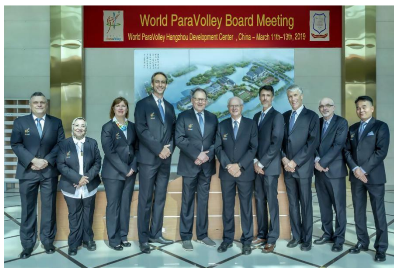
WPV Sports Development Meeting was held in WPV Hangzhou Development Center

The World ParaVolley Board completed its meeting by taking a visit of the China Goalball Base and the Sports Training and Guidance Center for the Disabled of Zhejiang Province as well.