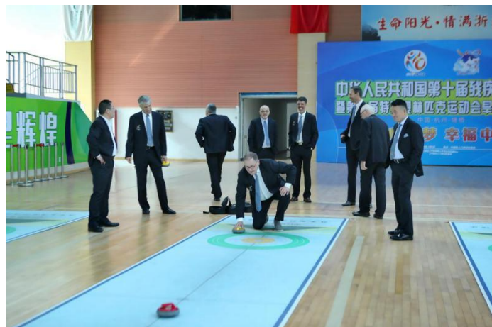
inspect the Dry-land curling competition venue of China Goalball Base