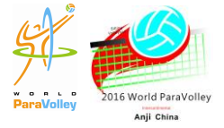
2016 World ParaVolley Intercontinental Qualified Women (QW) Results Table