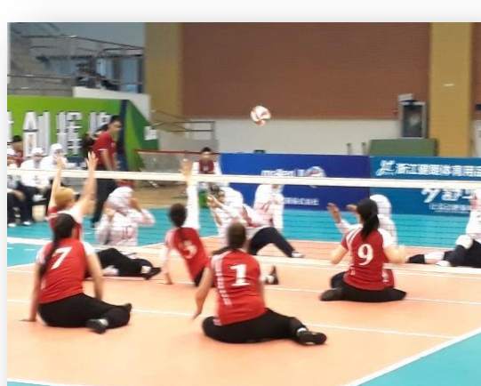
IR IRAN vs KAZAKHSTAN (Women)