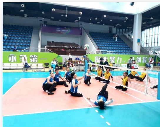
KAZAKHSTAN vs MONGOLIA (Women)