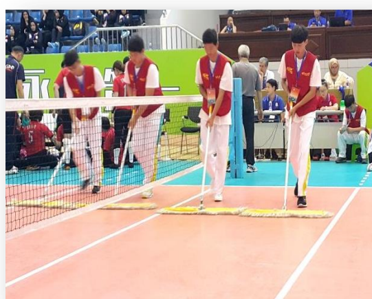
The Court Assistants