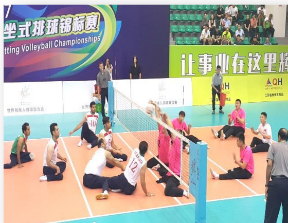
IR IRAN vs CHINA (Men)