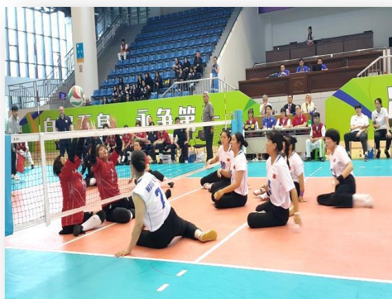
CHINA vs JAPAN (Women)