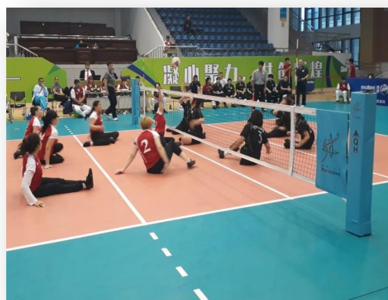
KAZAKHSTAN vs JAPAN (Women)