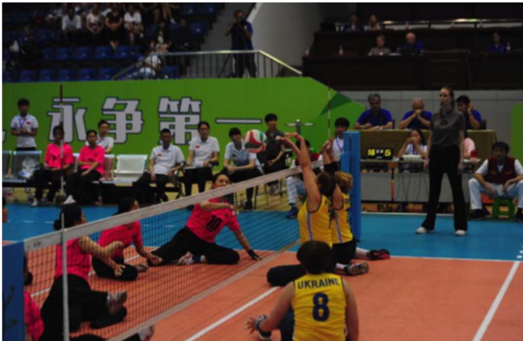
Photo 4 - CHN v UKR