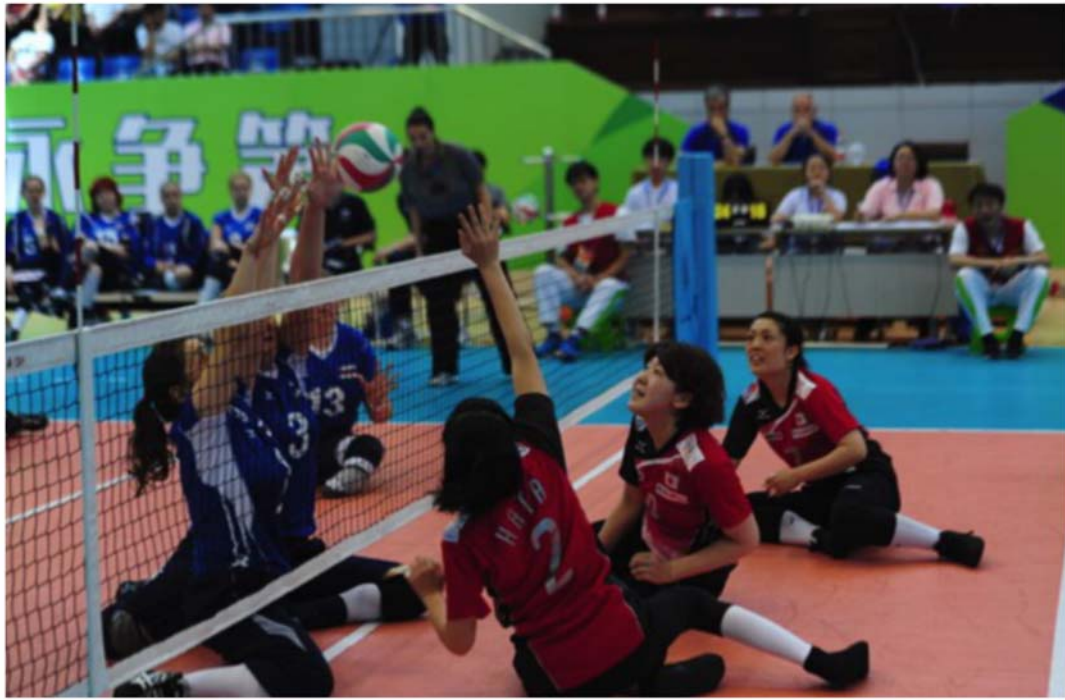
Photo 1 - RUS v JPN