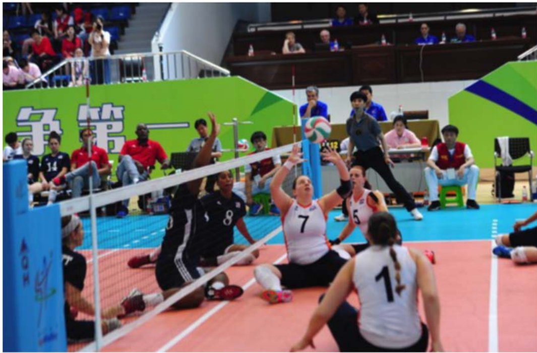
Photo 2 - USA v NED