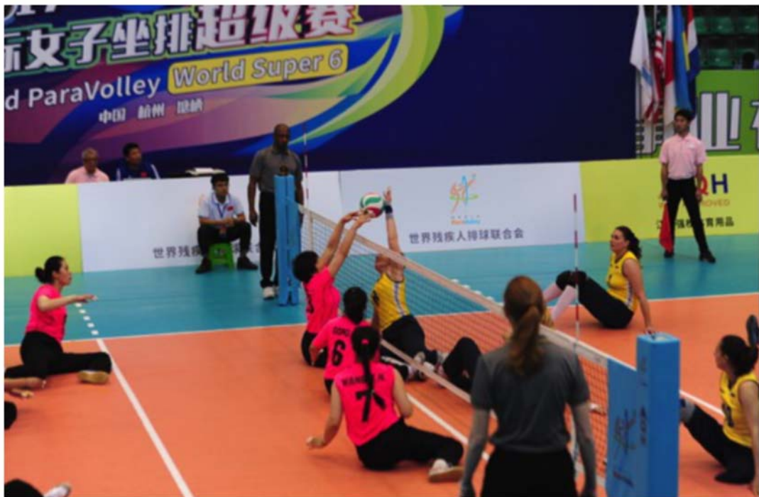
Photo 6 - CHN v UKR